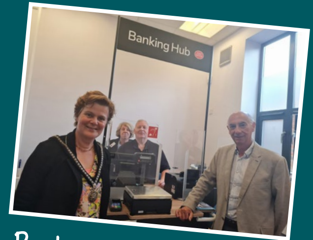
Buckingham Banking Hub