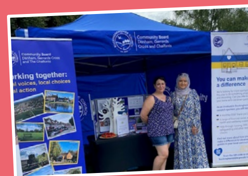
Feast of St Peter