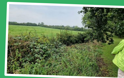
Wingrave walk & talk