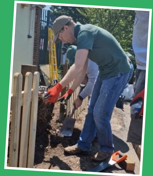
Ivers Community Growing Project