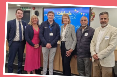
Chesham engagement event