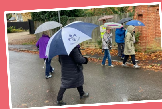
Southmead Surgery's Social Prescribers' Walk