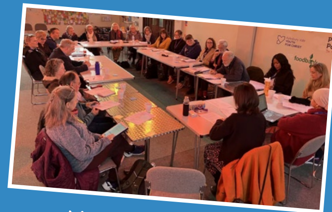
North-West ward partnership meeting