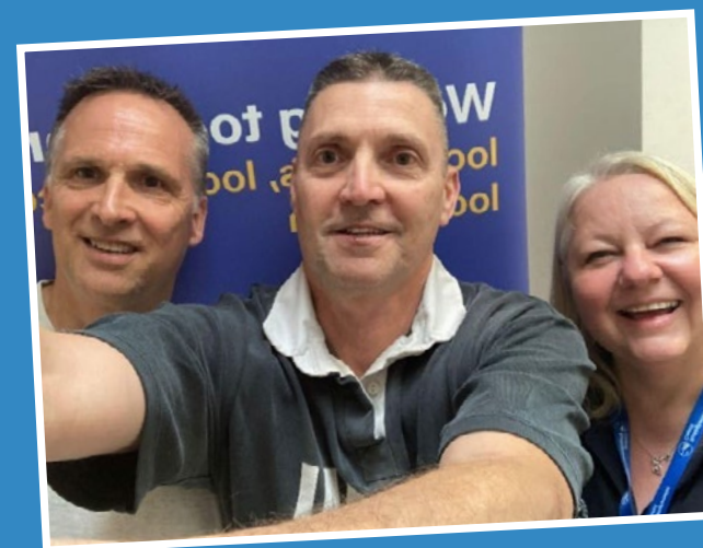
Bucks Pro Mai Self defence classes for Women and girls