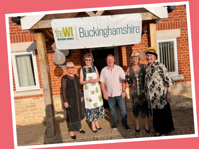
WI 100 year anniversary