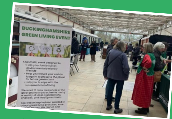
Quainton Green Living Event