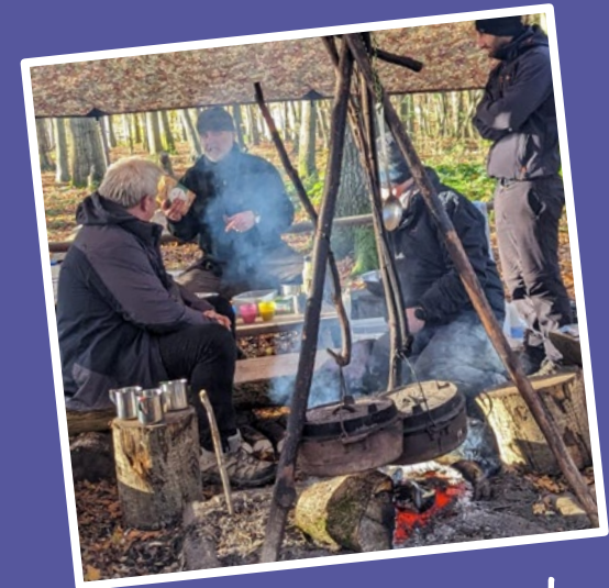
FED UP! project