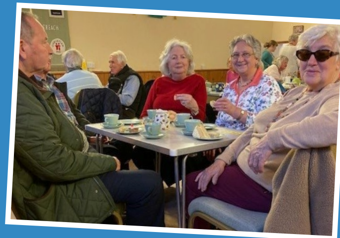
Digital inclusion sessions