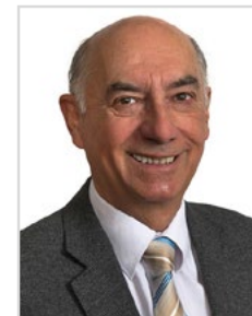
Howard Mordue Buckingham & Villages