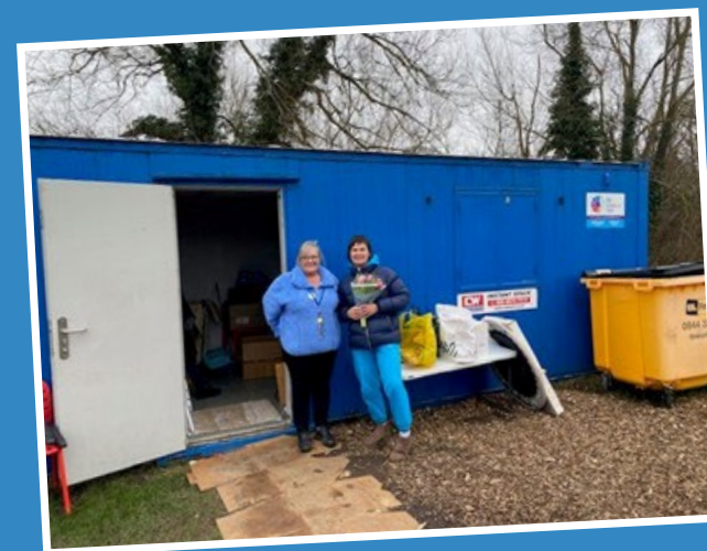
The Kindness Club