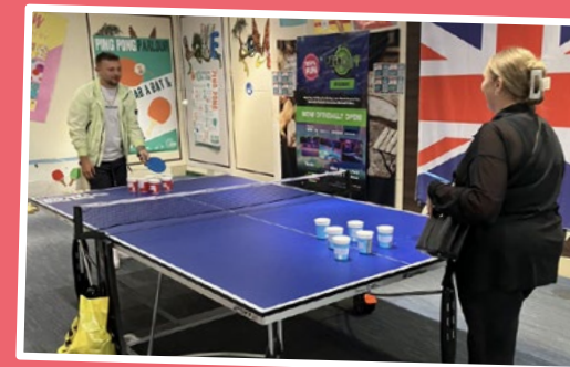
Aylesbury Community Pong