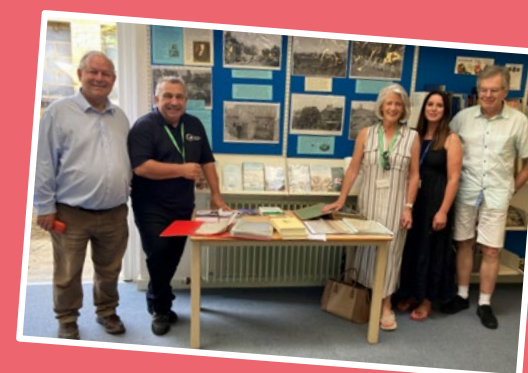
Winslow heritage event