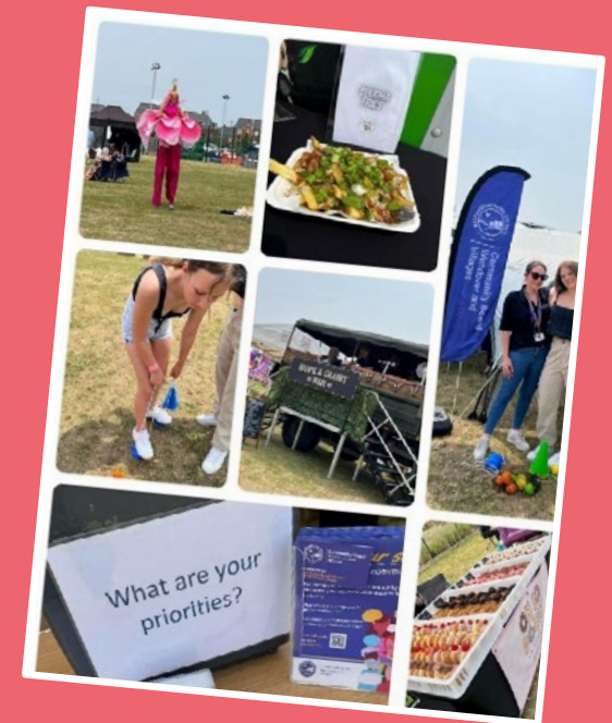
Kingsbrook Community event