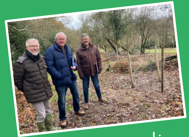
Hedgerley Conservation Volunteers