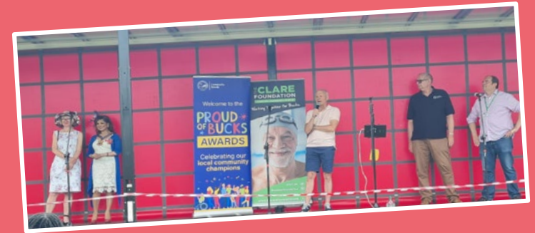
Princes Risborough Party in the Park