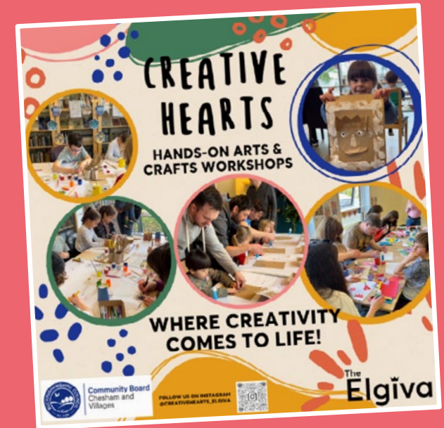
Creative hearts project