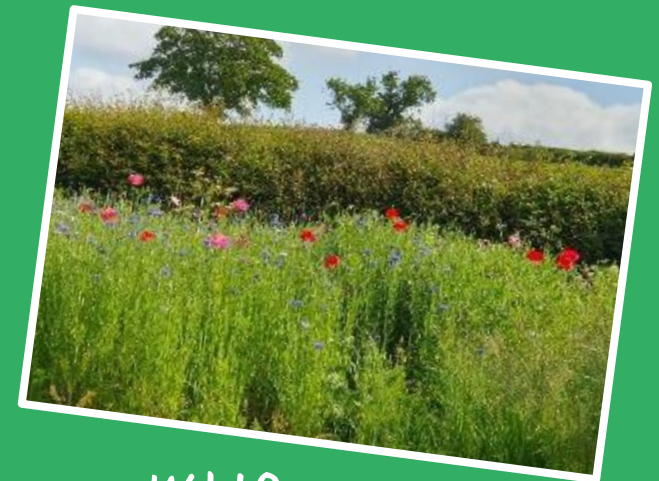
Wildflowers in Coronation Meadow