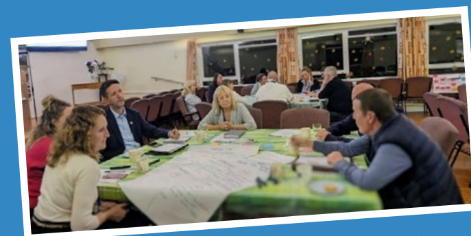
Chesham Ward Partnership