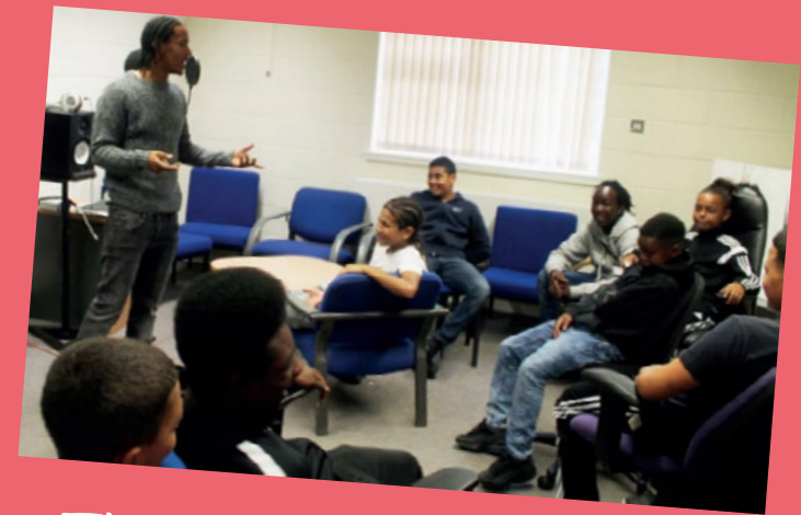
The Secret Place project