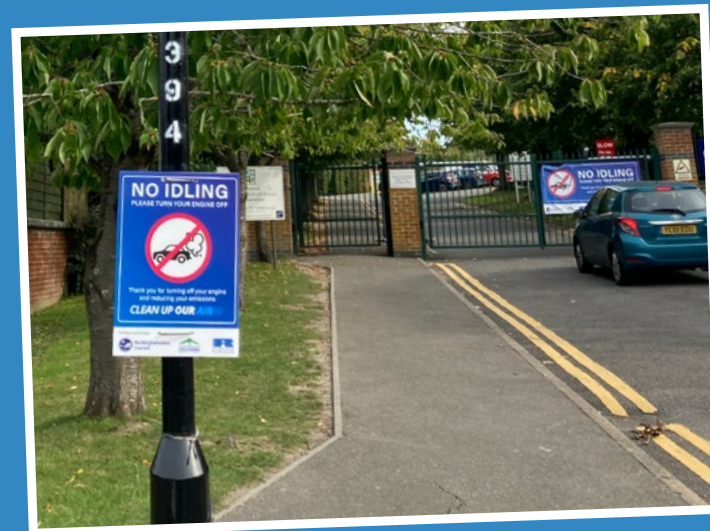
Princes Risborough School anti-idling event