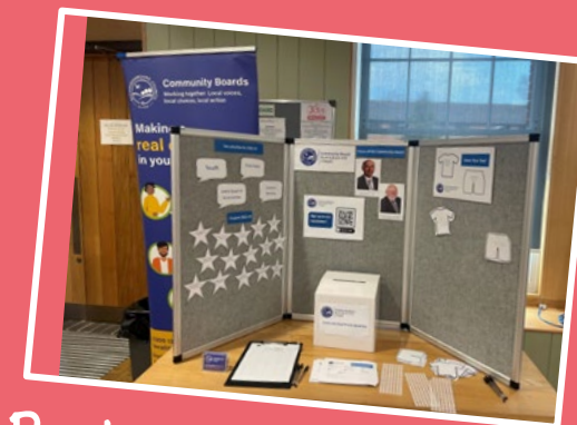
Buckingham and Villages engagement