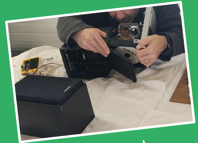
Wing and Ivinghoe Repair Café