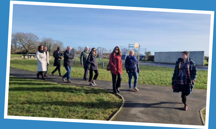
Local issue tours

OPPORTUNITY | SUCCEEDING BUCKS | FOR ALL