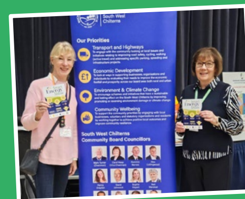
Smart Energy Show