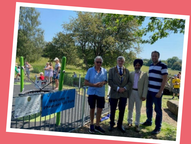
Chalfont St Giles refurbished playground