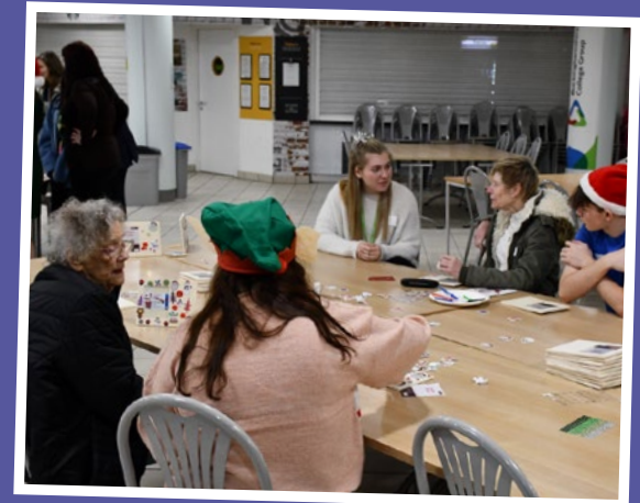
Bucks College Group Student led Christmas event